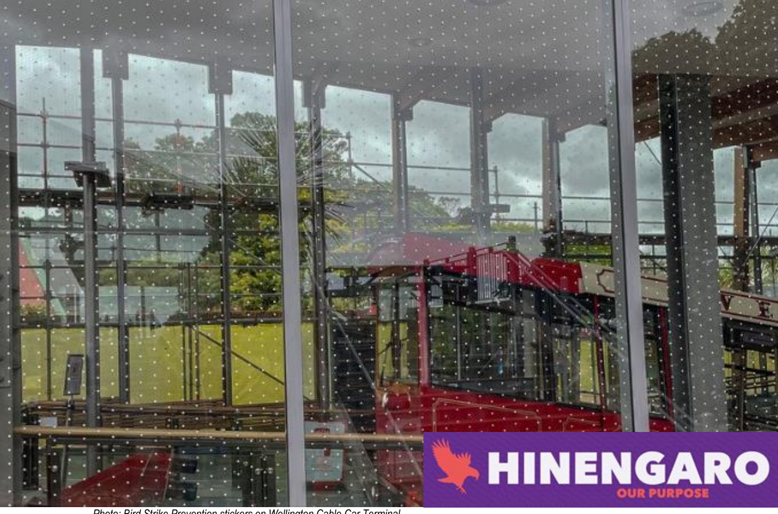
Photo: Bird Strike Prevention stickers on Wellington Cable Car Terminal