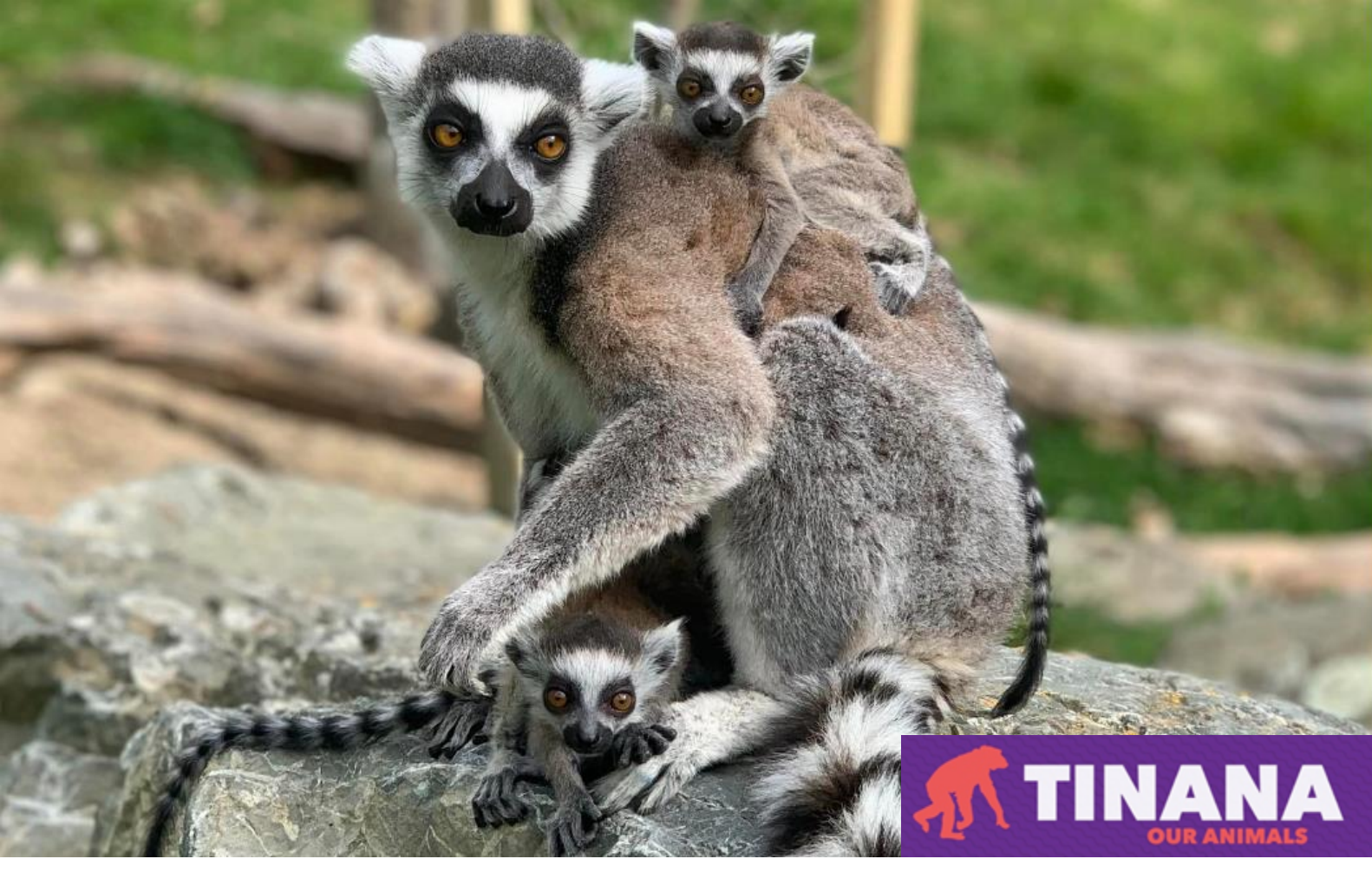
Photo: One of the four sets of Ring-tailed Lemur twins born in September (L Ridley)