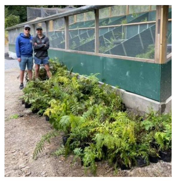
Photo: Te Motu Kairangi plant donation for the Te Hononga Tuatara habitat (D Laux)