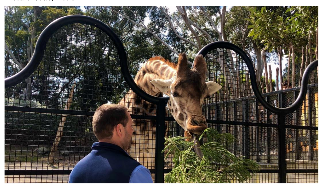
Photo: a new Behind the Scenes Giraffe experience was launched in the refurbished Giraffe House and yards