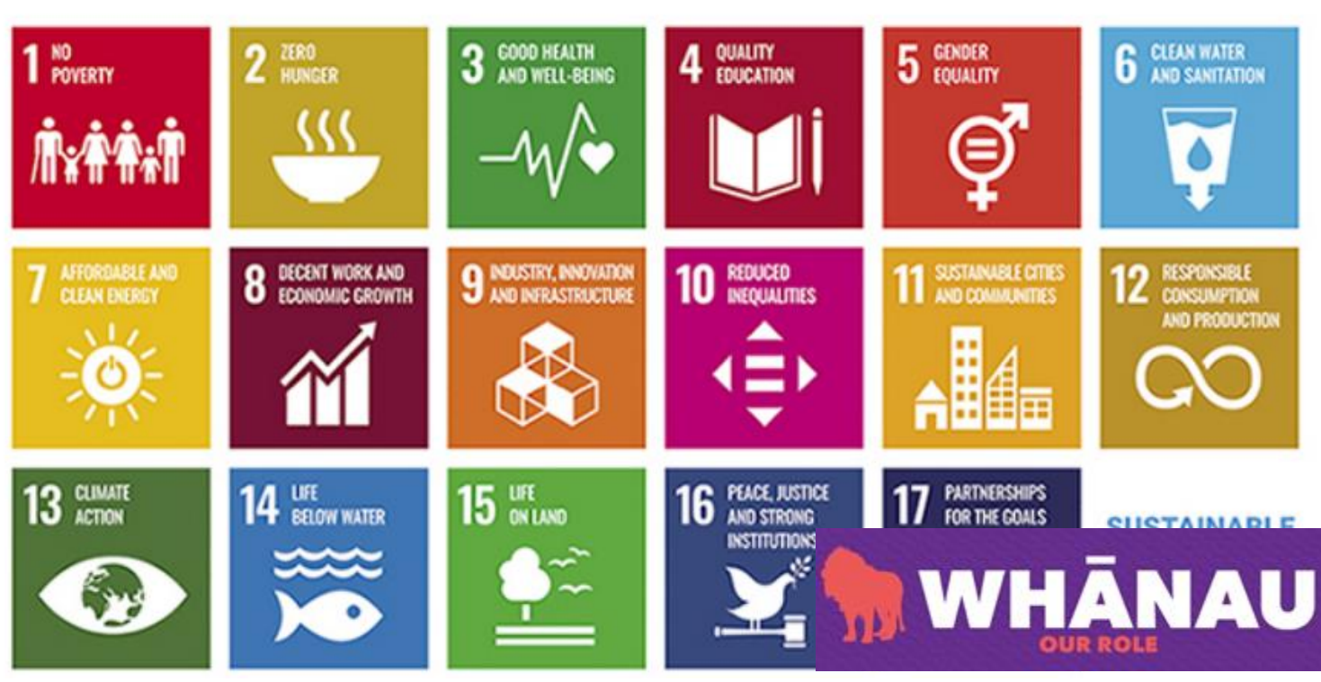
United Nations Sustainable Development Goals