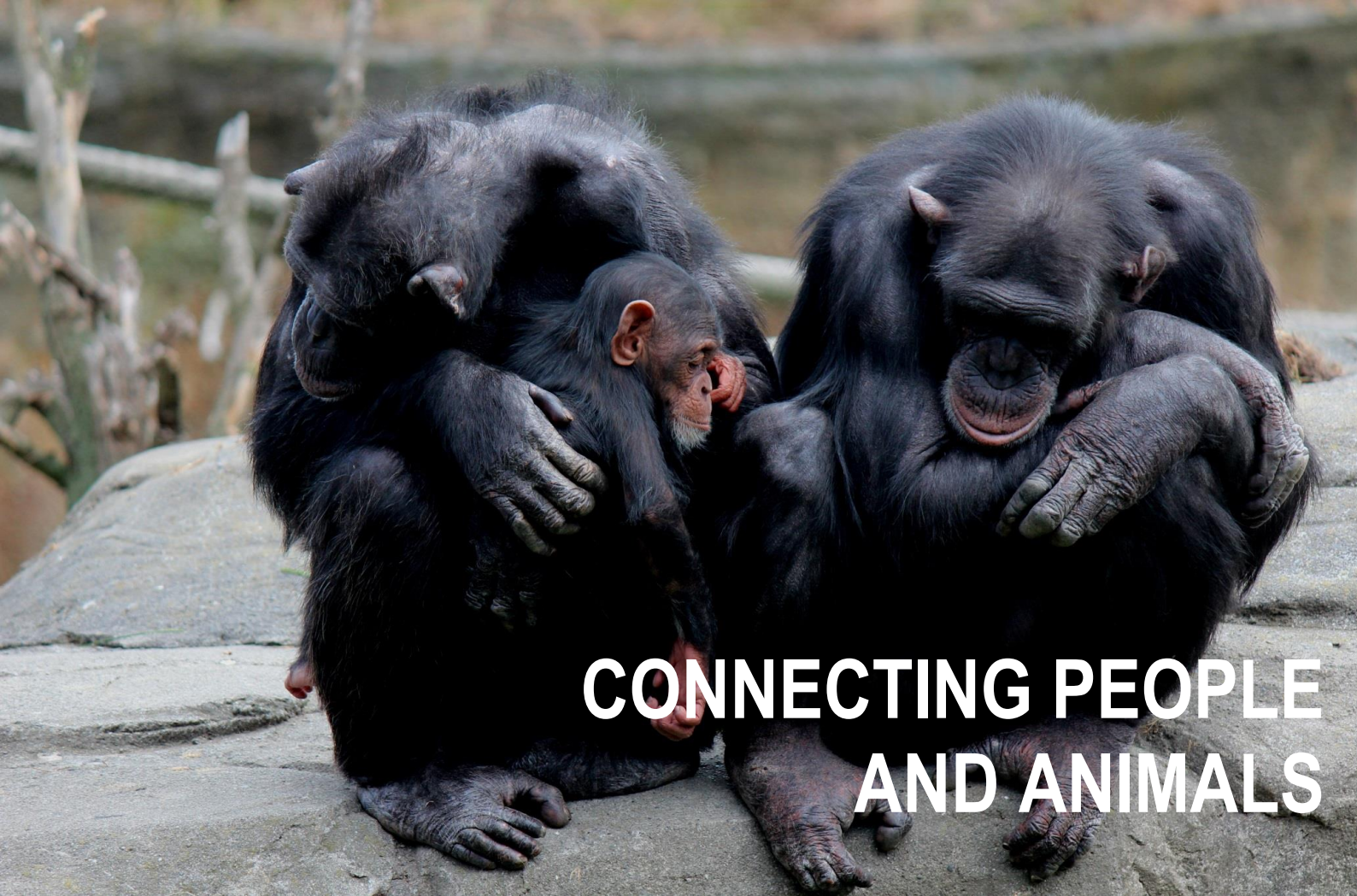
Inaugural World Chimpanzee Day, 14 July 2018

Several media opportunities arose during the quarter: