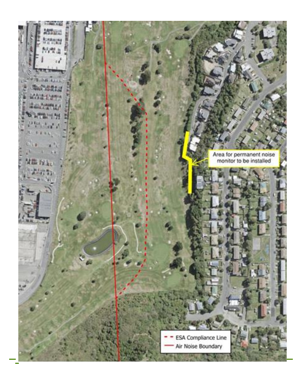
Figure 1: Aircraft operations EEA compliance line. SUPERCEDED