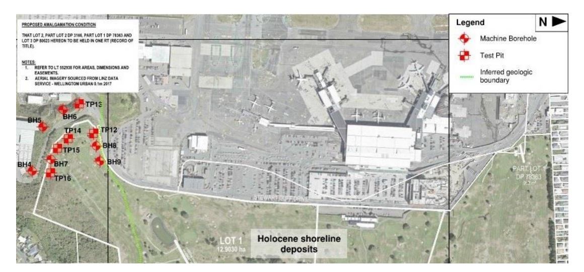
Figure 3: Mapped geologic units and previous geotechnical investigations.

16. Previous ground investigations in the area of the proposed cut-slope were collated from a review of the New Zealand Geotechnical Database (NZGD), and internal Beca reports. Investigations were previously completed for the waste-water treatment facility immediately south-west of the site, as outlined in Beca Stevens (1990)<sup>2</sup>. Approximate locations of the investigations are shown in Figure 3.