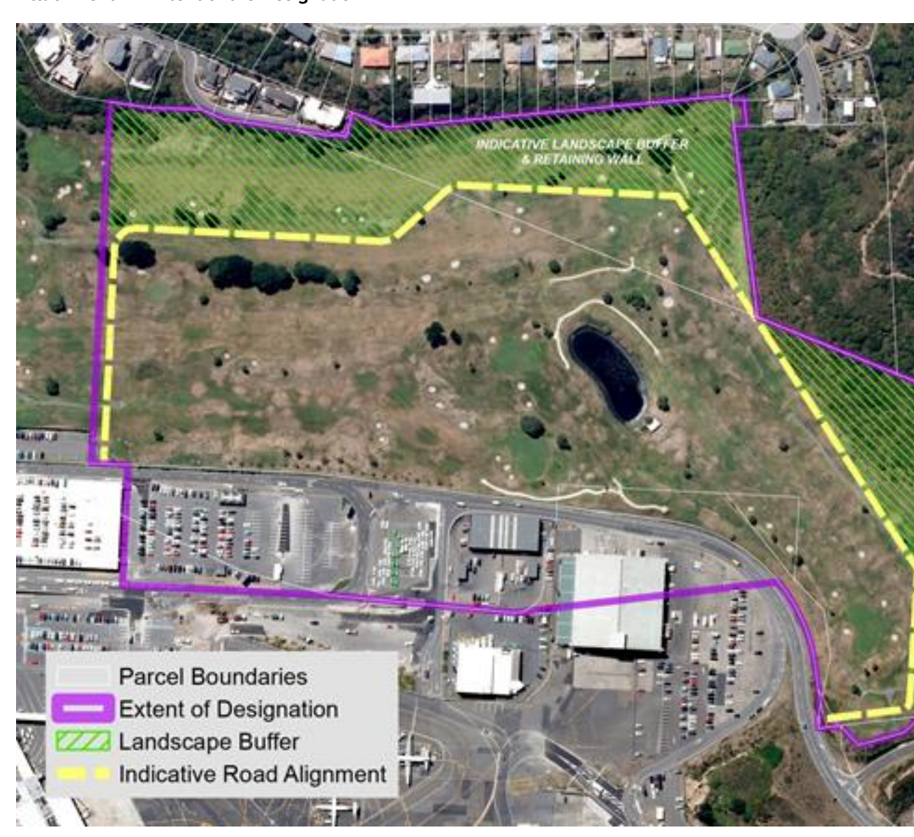
Attachment 1 – Extent of the Designation