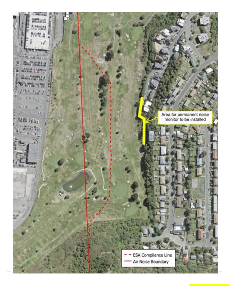
Figure 1: Aircraft operations EEA compliance line.— to be updated with a new figure — see Laurel Smith summary evidence

c. The operation of unscheduled flights required to meet the needs of any state of emergency declared under the Civil Defence Emergency Management Act 2002 or any international civil defence emergency.