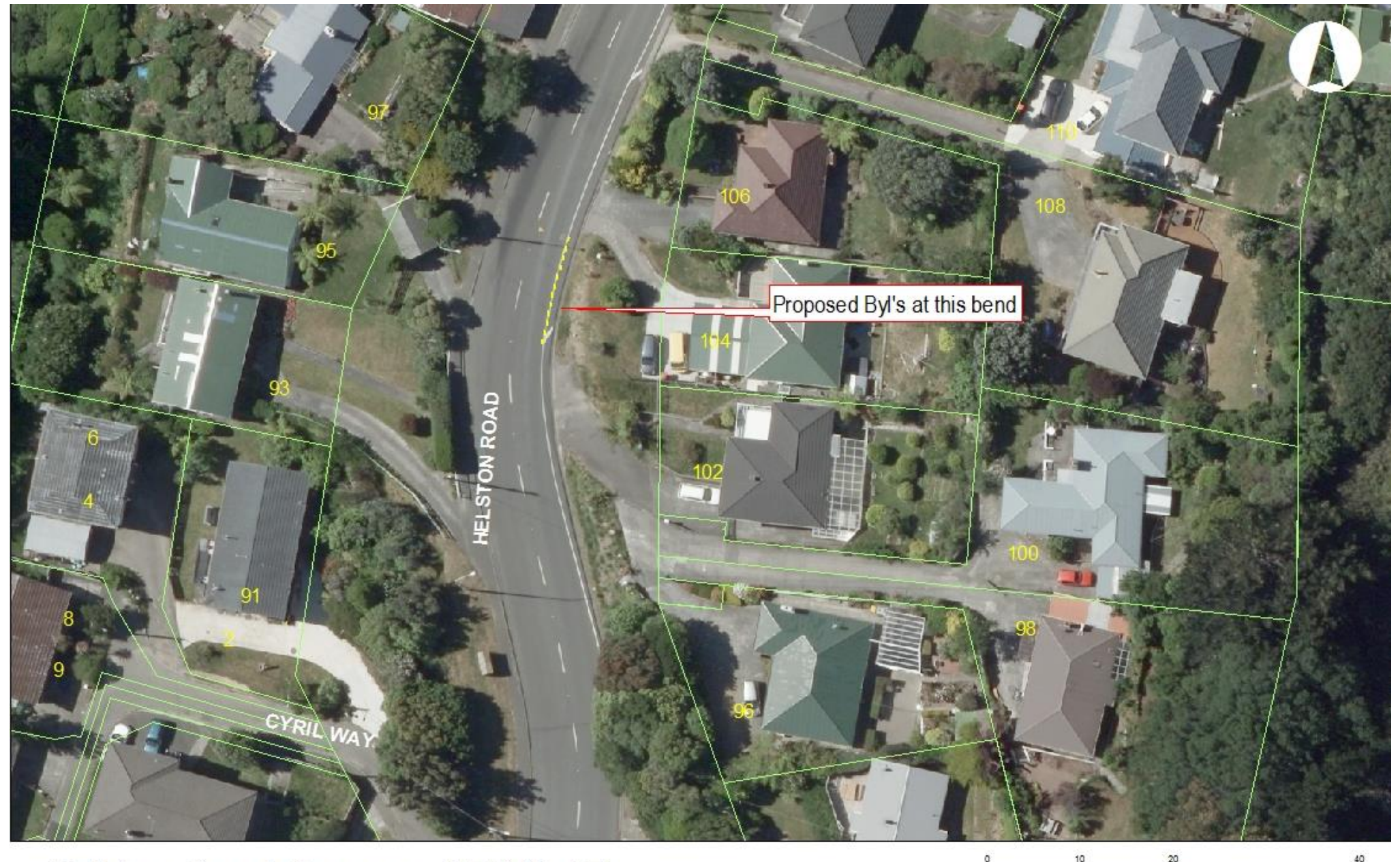
Helston Road Paparangi TR(3-15) Proposed No Stopping on the bend