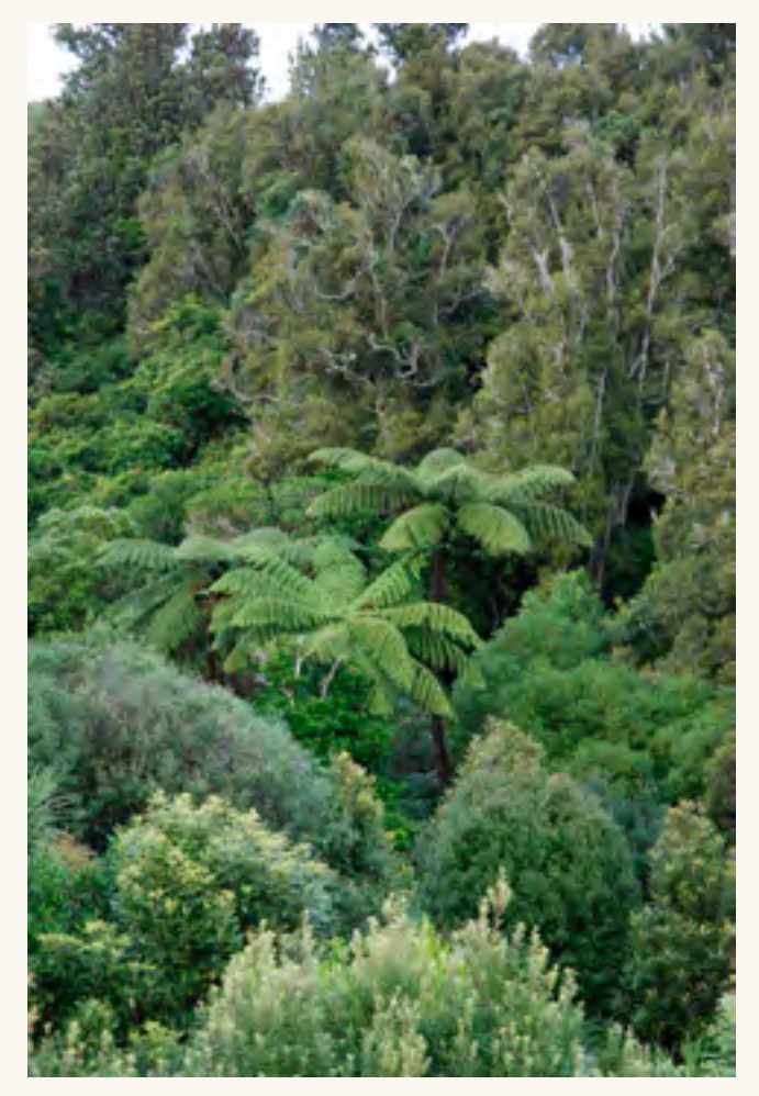
Tawa dominated canopy with typical gully species

The composition of the species changes depending on aspect, whether it is a valley floor or hillside, elevation, and whether the canopy is dominated by māhoe, tawa or kohekohe as well as proximity to the sea.