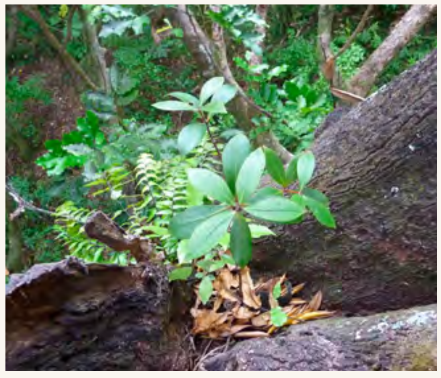
Tāwhiri karo "planted" into a tree hollow.