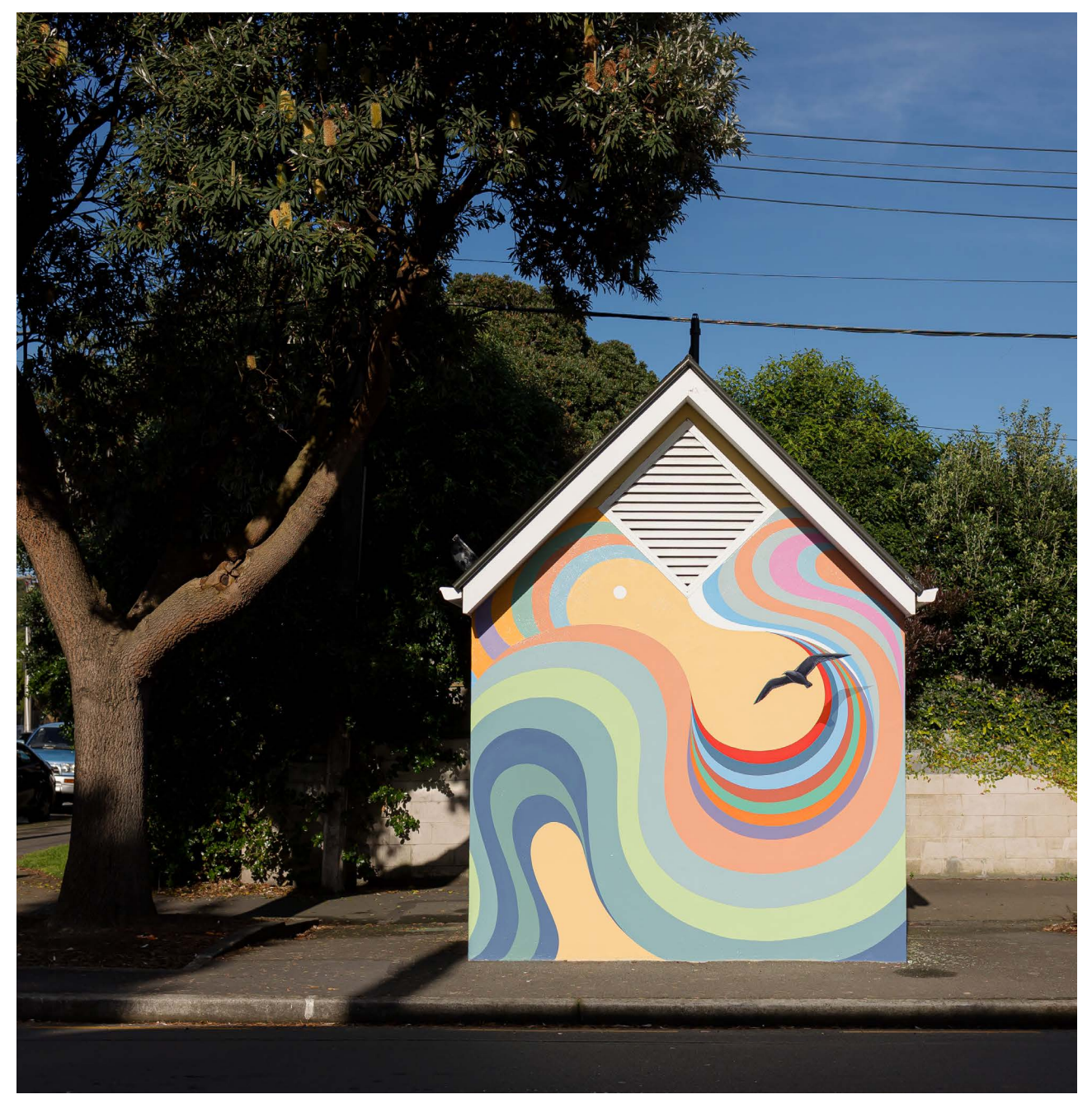
Gina Kiel, toilet block mural (detail) on Medway Street, Island Bay.