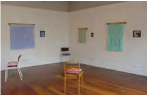
Ready-made Everyday at Enjoy Public Art Gallery