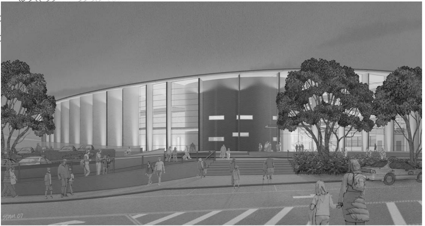
Illustration by www.stantialstudio.co.nz ©