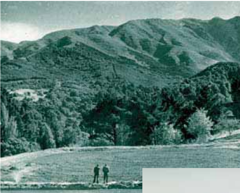
Natural succession on the hills behind Wilton between 1950 and 1998

Only a few remnants of the original vegetation patterns in Wellington survived the massive land clearances of the nineteenth century. Currently, large areas of marginal land surrounding the city are undergoing a natural succession from pasture to gorse and scrub and finally to native forest, as external factors make farming less viable.