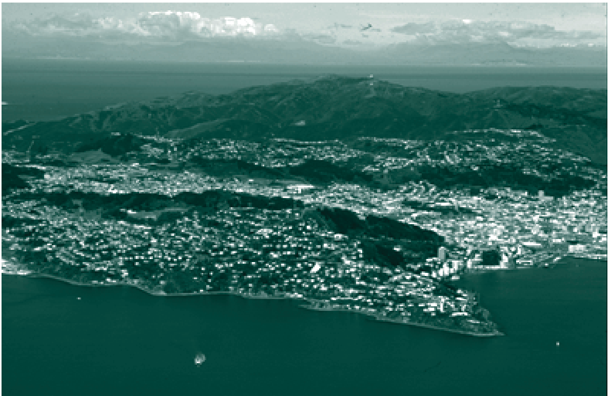
Aerial view of the Wellington peninsula showing the Town Belt and the hills along the proposed Outer Green Belt

Council believes that open space is a key part of managing the city's urban form by containing the built environment and interweaving the natural with the built environment.