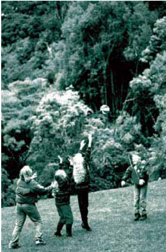
Troup Picnic Site, Otari/Wilton Bush

Council's open space objectives need to be sufficiently general and flexible to allow Council to respond to opportunities as they arise and to negotiate good value for money.