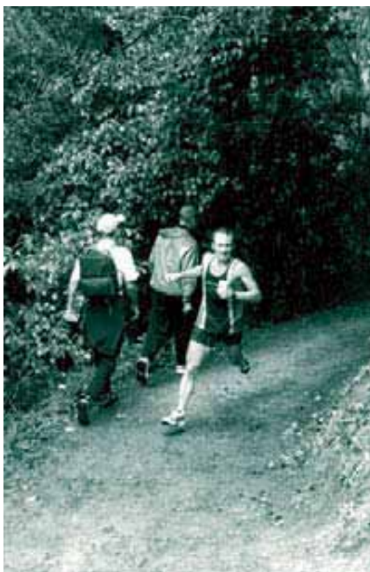
Bush track in Hataitai Park, Mt Victoria

For example two separate walking tracks provide two recreational opportunities. If the two tracks are linked, they provide three recreational opportunities, as people can choose to walk either of the individual tracks, or they can walk a longer combined track. The more complex the recreational network, the more choice and opportunities it offers for users.