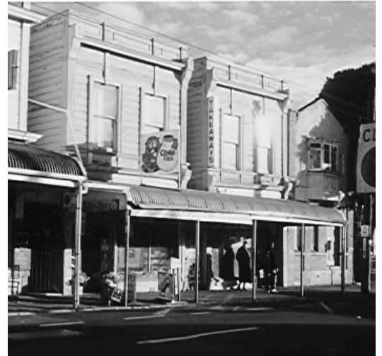
Typical upper Willis Street retail

(TA) G4.2 Accentuate the importance of Willis Street by locating primary building frontages along them.