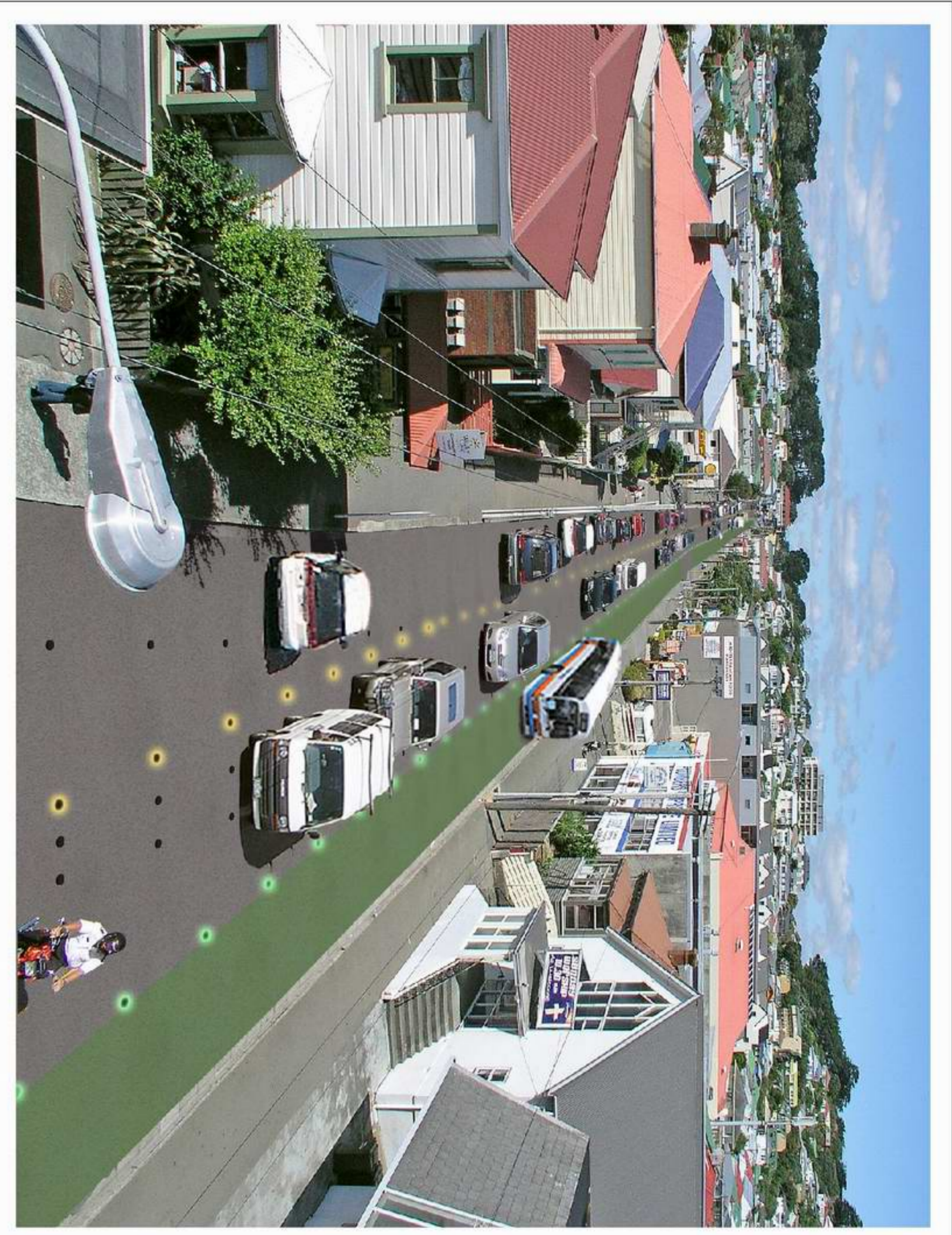
Proposed AM Tidal Flow