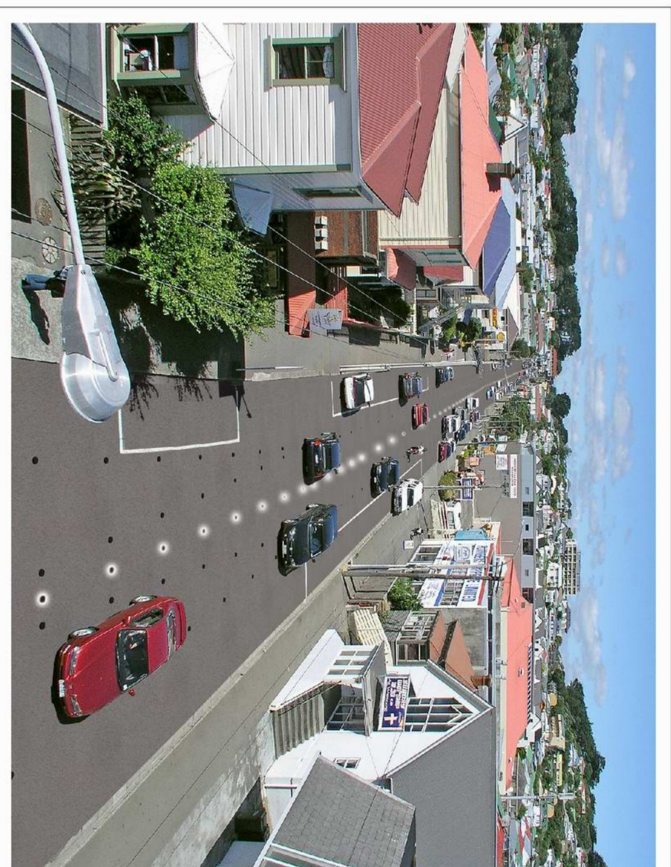
Proposed Off Peak Tidal Flow