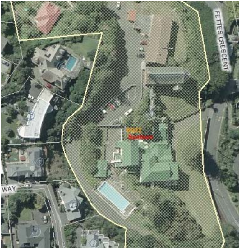
Photo of chapel building at 16 Fettes Cres