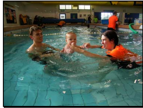
Papakowhai School Sports and Pre-school Learn to swim