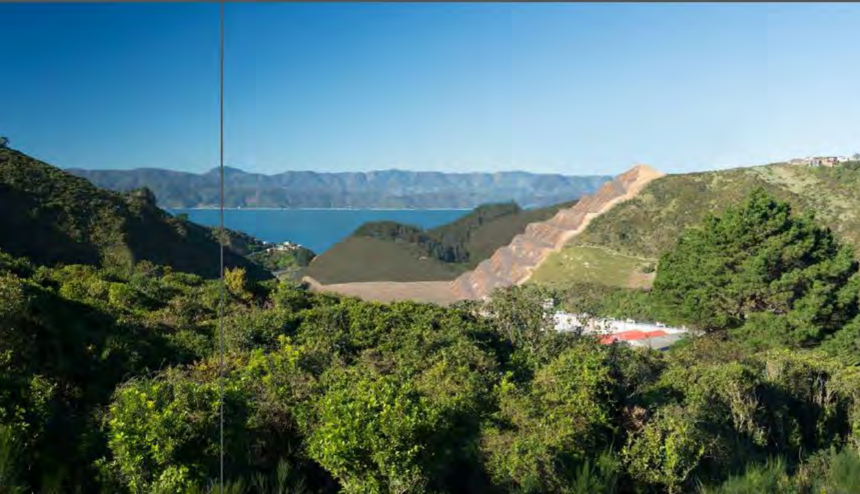
Option 3 Limited Development Unmitigated