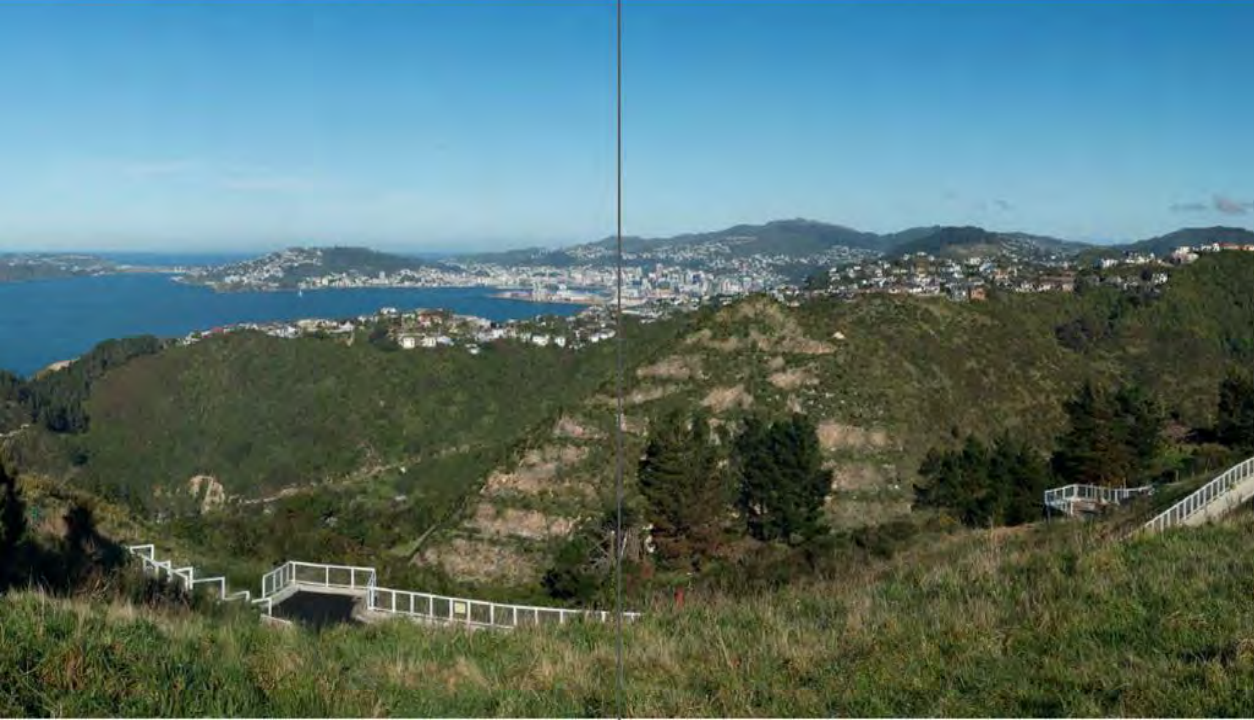
Option3 Medium Development Mitigated 15 to 20 year