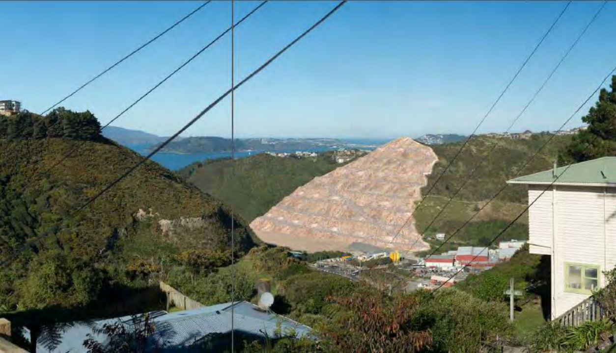
Option 3 Limited Development Unmitigated