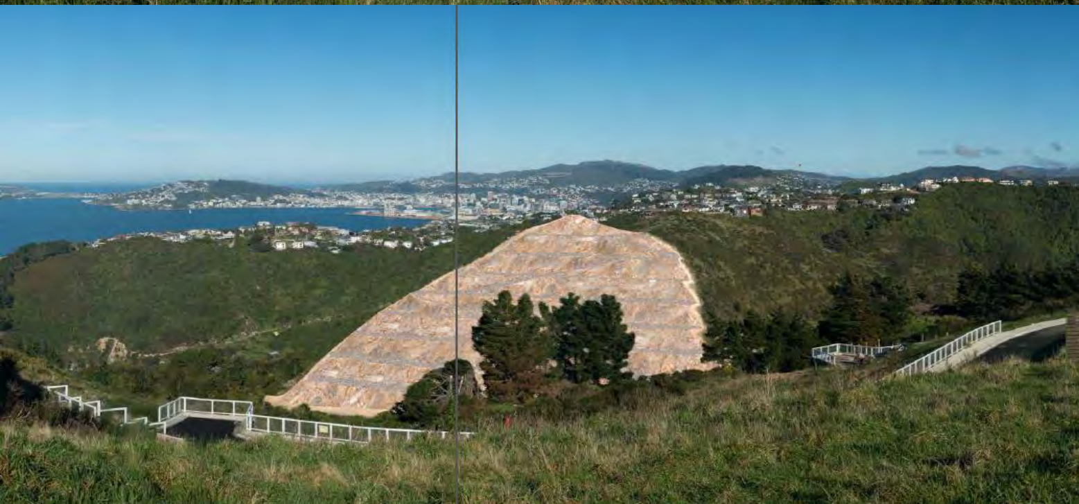
Option 3 Medium Development Unmitigated