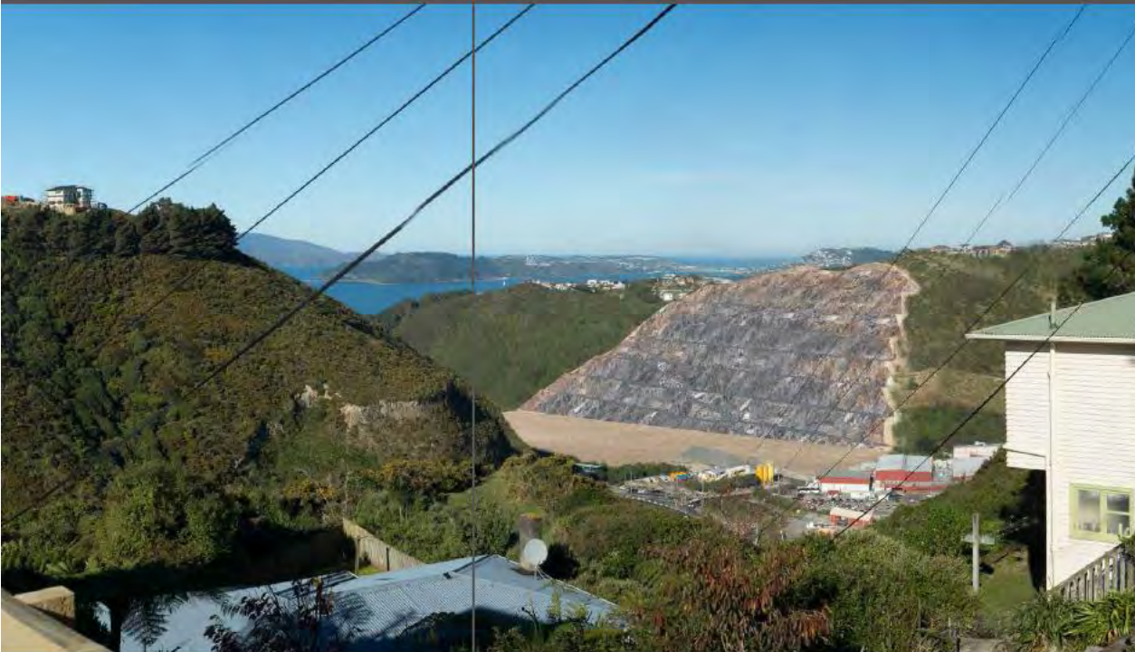
Option 4 Maximum Development Unmitigated