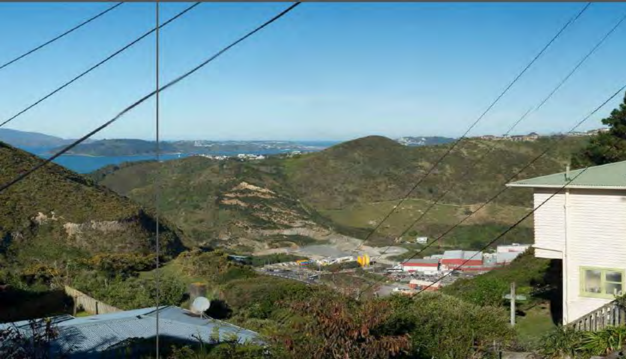
Kitchener Terrace Johnsonville Existing view