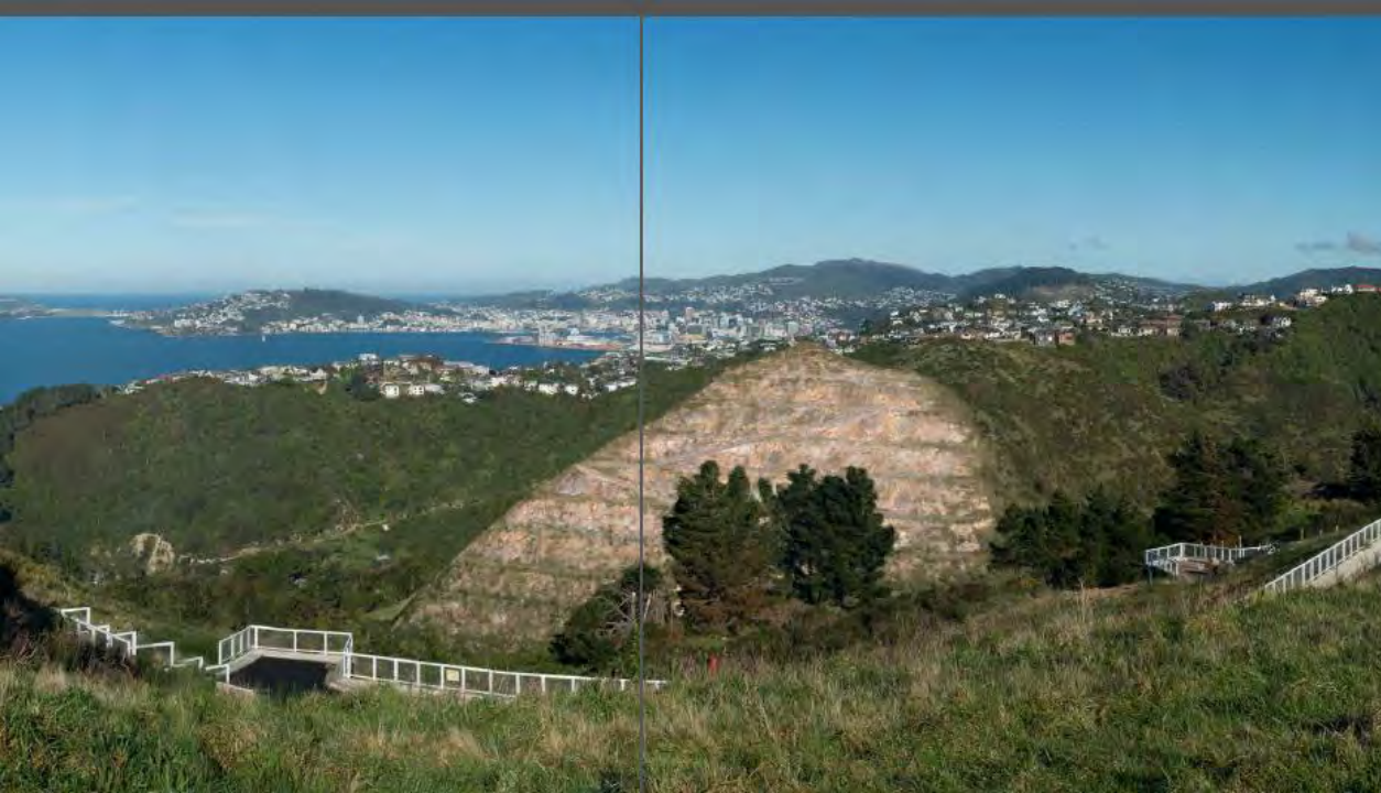
Option 3 Medium Development Early Mitigation one year