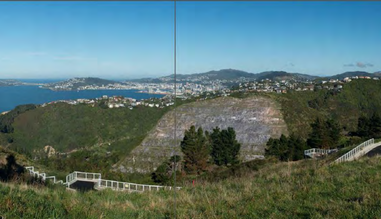
Option 4 Maximum Development Early Mitigation one year