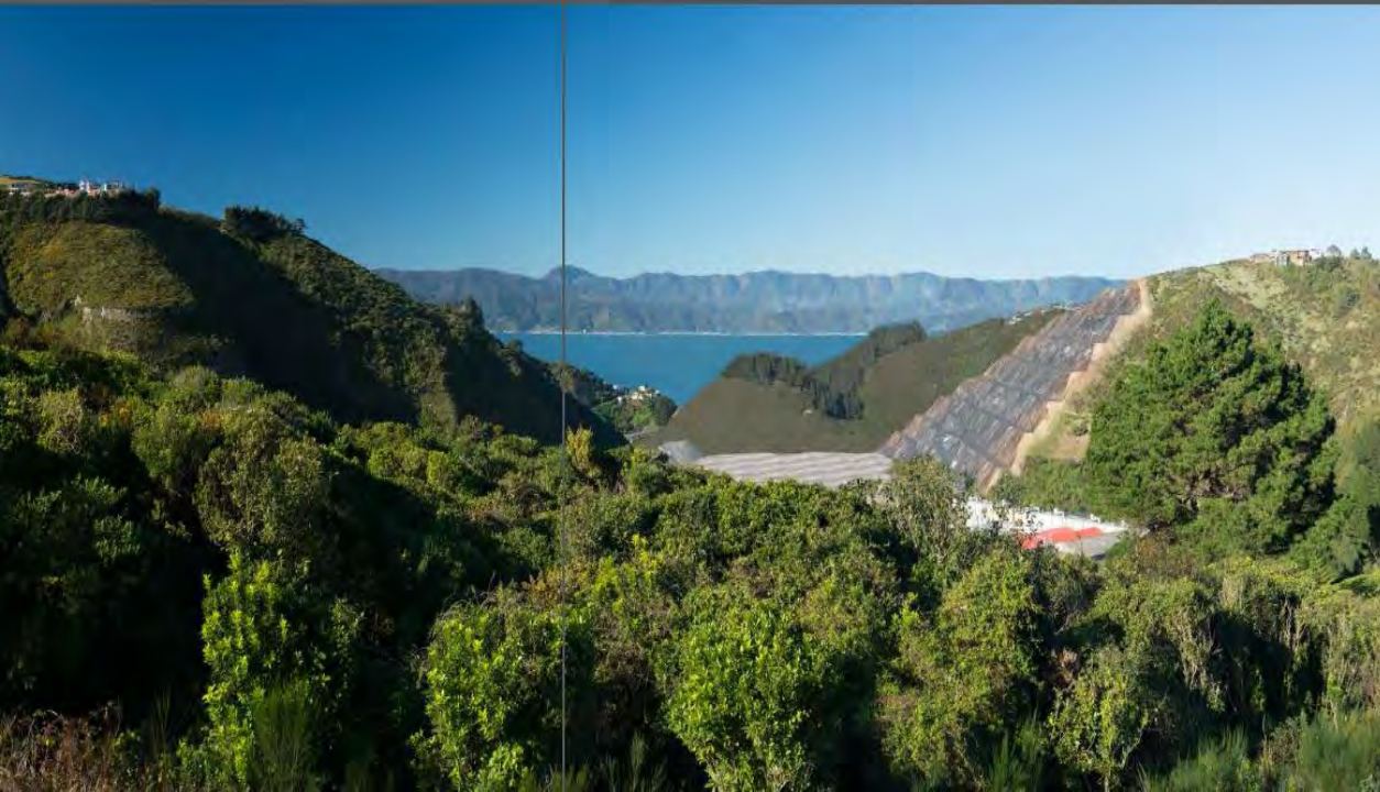
Option 4 Maximum Development Unmitigated