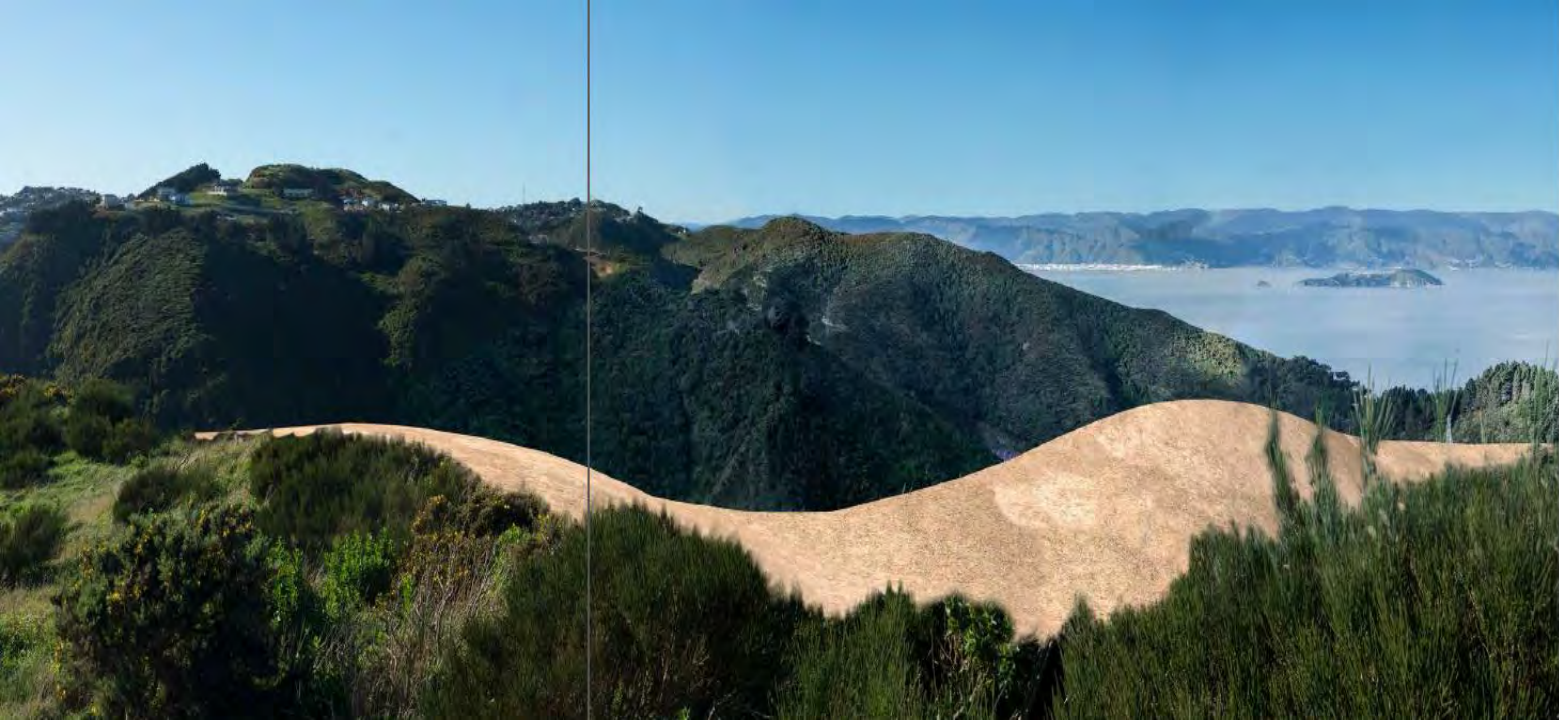
Option 4 Maximum Development Unmitigated