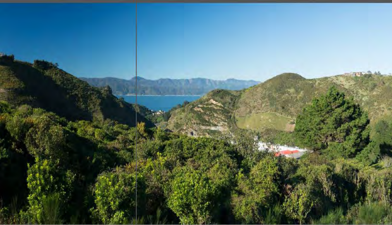
Frazer Avenue Johnsonville Existing view