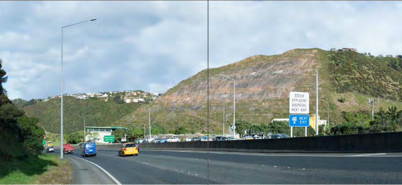
Option 4 Maximum Development Early Mitigation One year