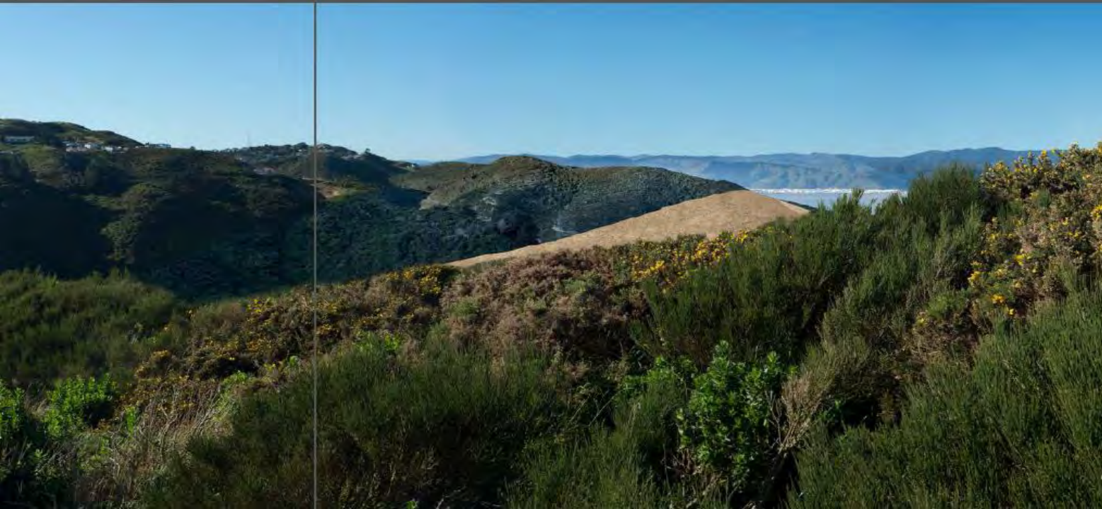
Option 3 Medium Development Unmitigated