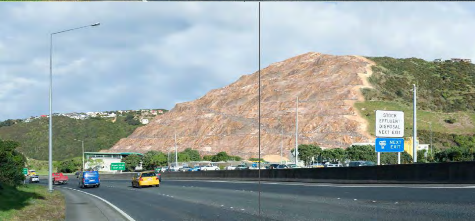
Option 3 Medium Development Unmitigated