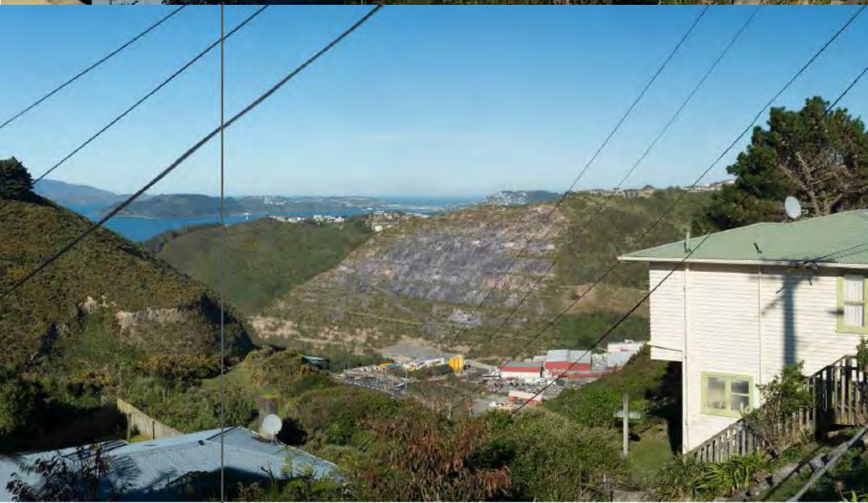
Option 4 Maximum Development Early Mitigation One year