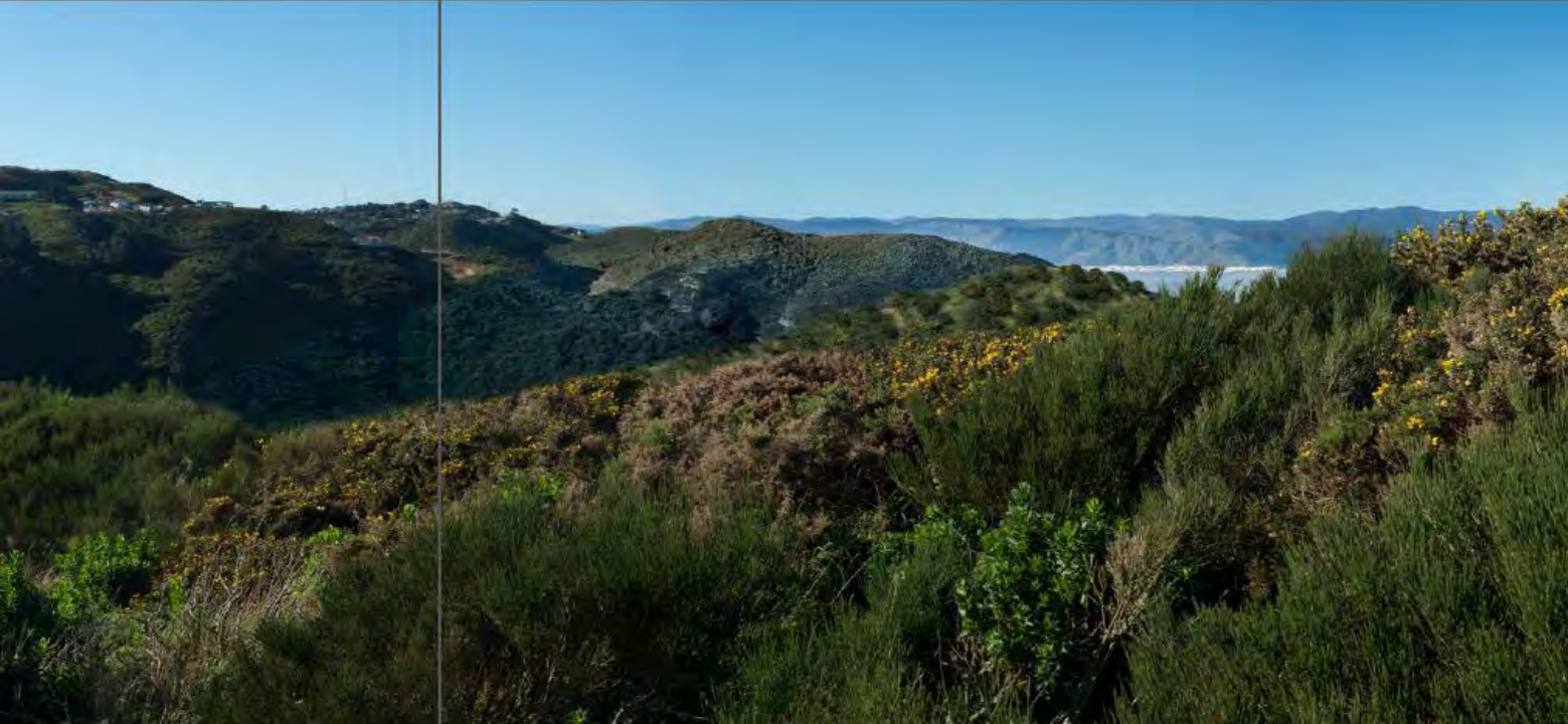
Option 3 Medium Development Mitigated 15 to 20 years