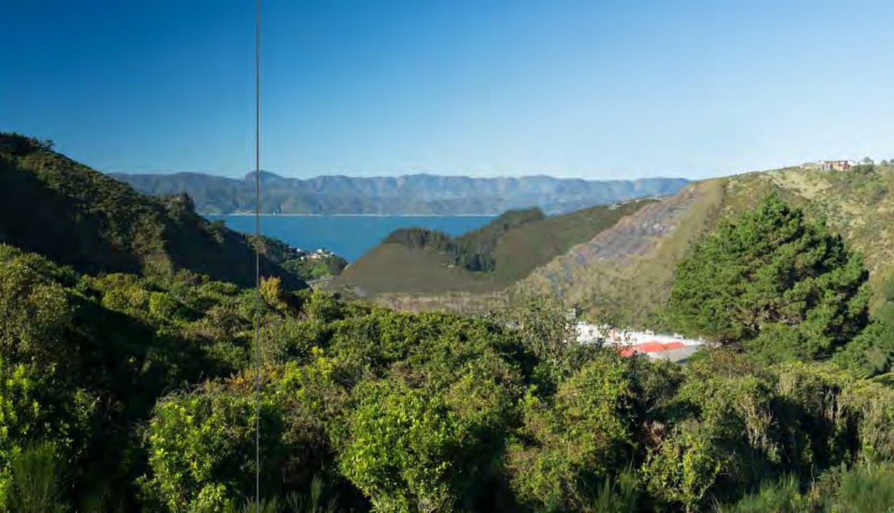
Option 4 Maximum Development Early Mitigation One year