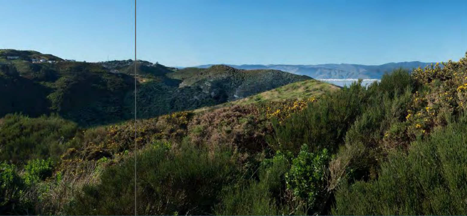
Option3 Medium Development Early Mitigation One year