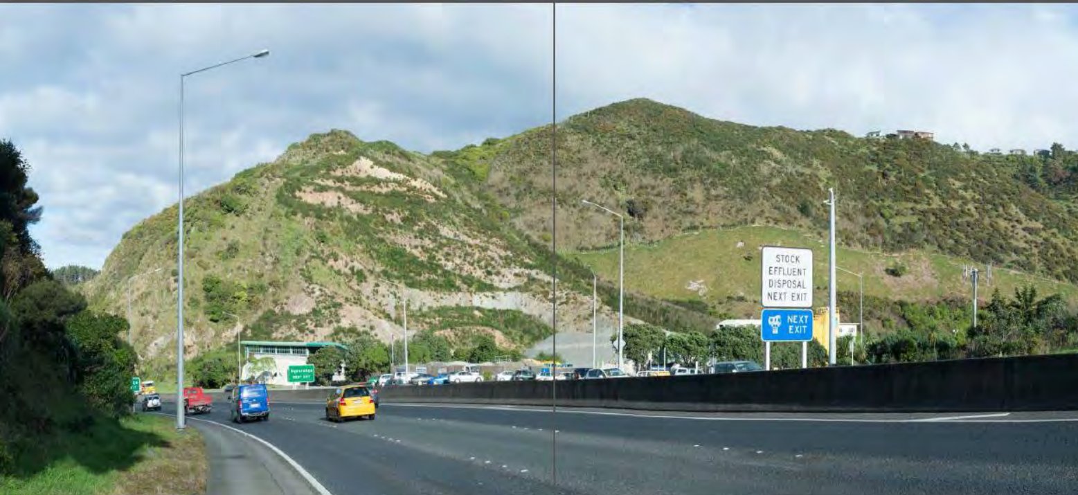
SH 1 Existing view