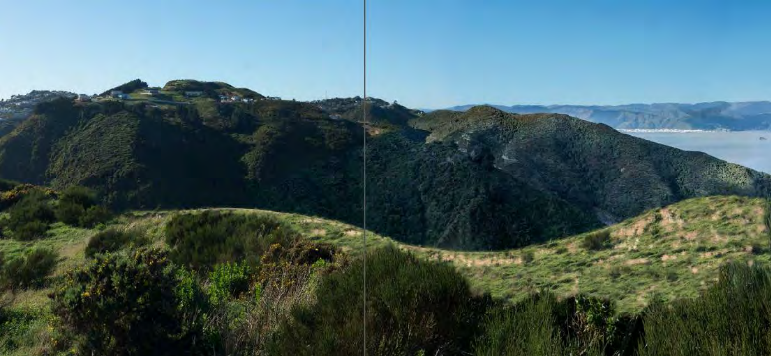
Option 4 Maximum Development Early Mitigation One year