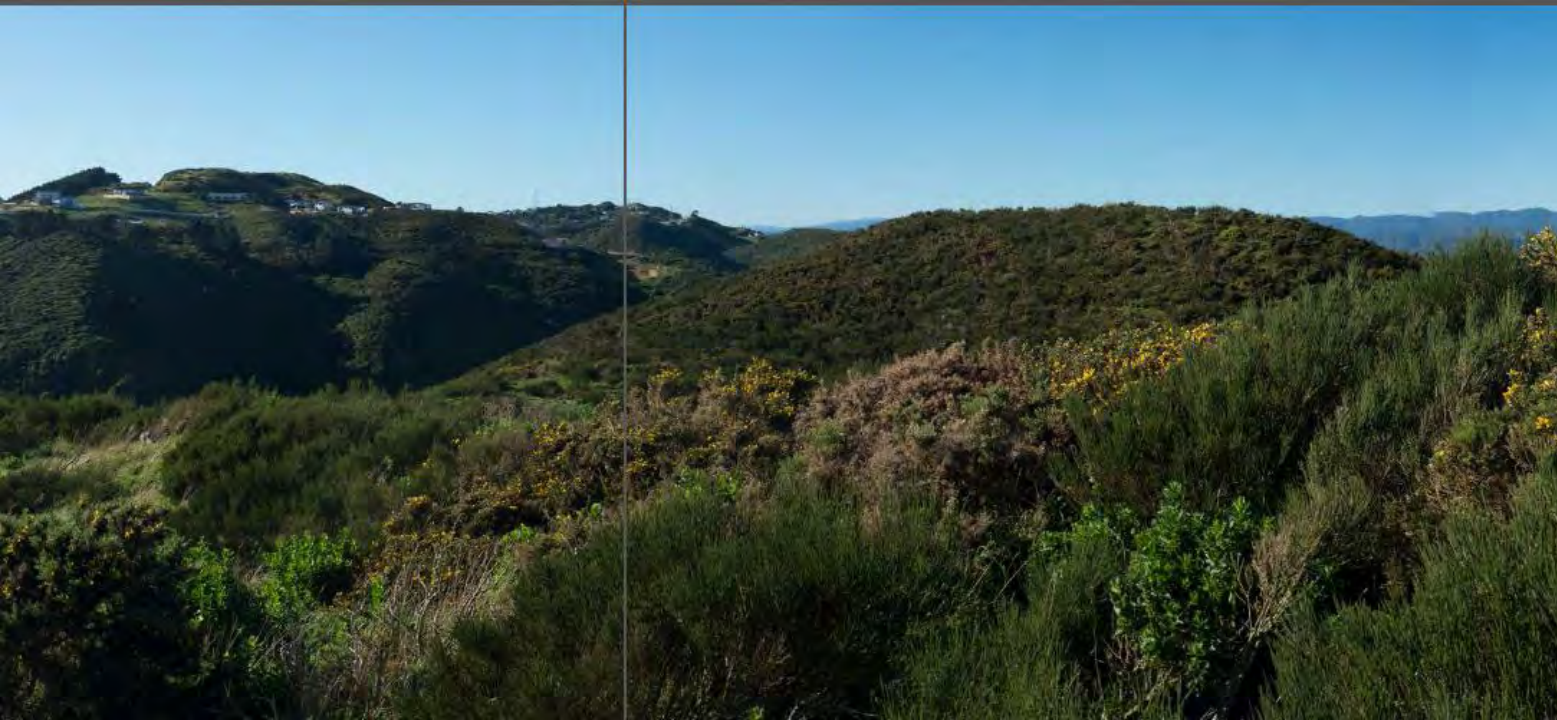
Shastri Terrace Khandallah Existing view