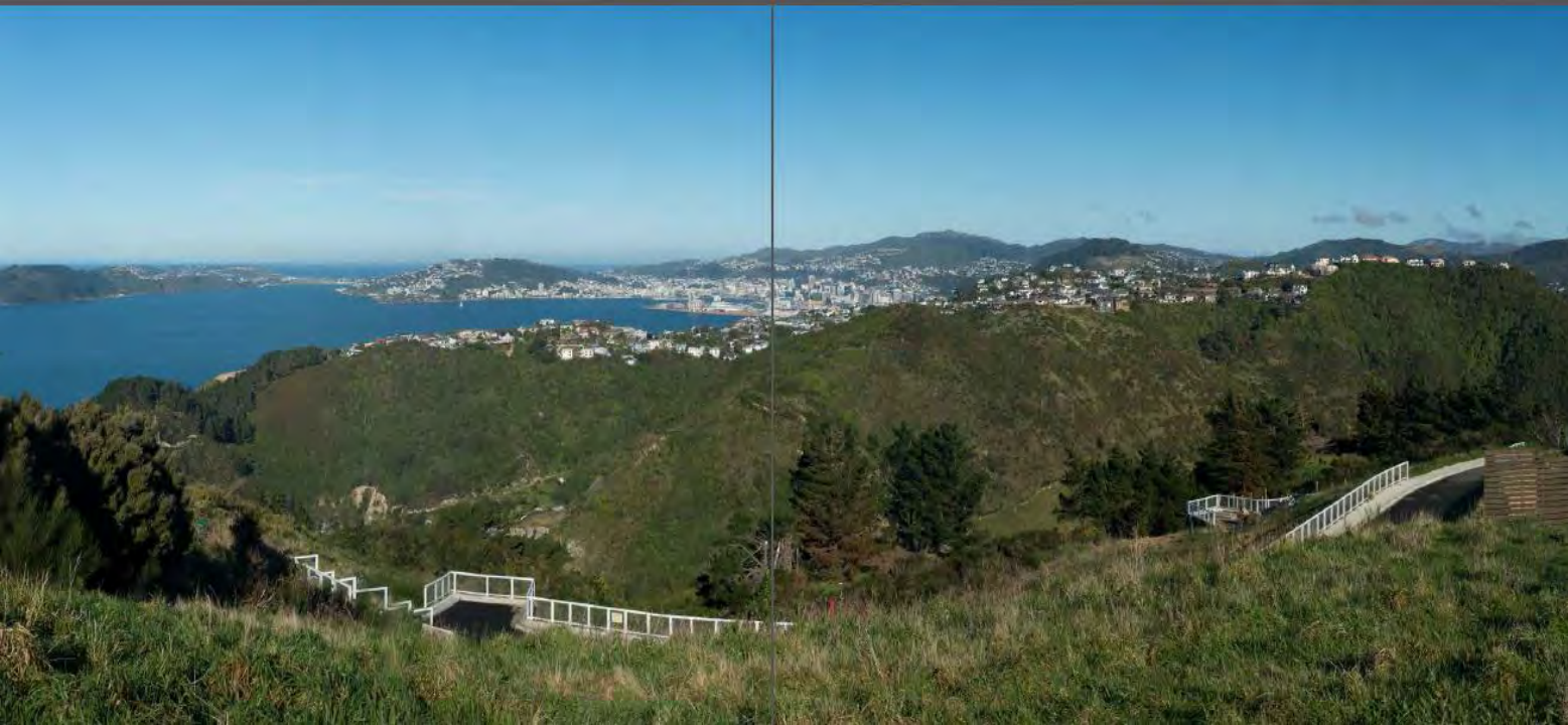
Intersection of Grumman Lane & Spenmore Street Existing view