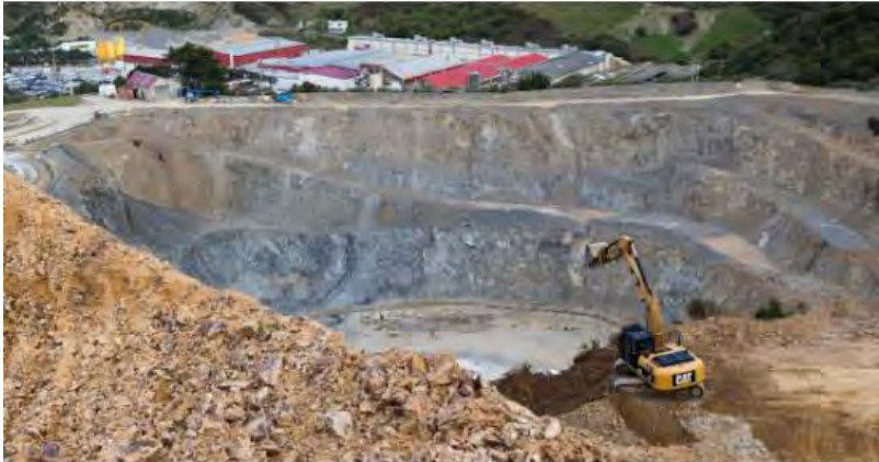
Shared with 3 Other Neighbourhoods in Noticeboard

For more info and to have your say click here