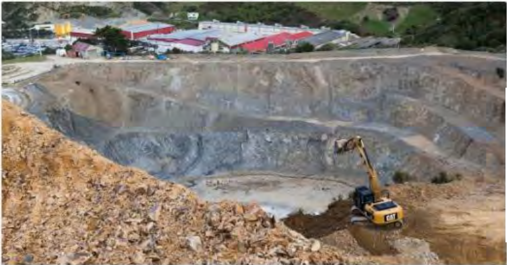
Kiwi Point Quarry expansion wellington.govt.nz

We're looking at expanding Kiwi Point Quarry as the existing north face has only a few years of remaining life (based on the current rate of extraction). Consultation is now live and open til 30 October. We'd like your feedback ...see more