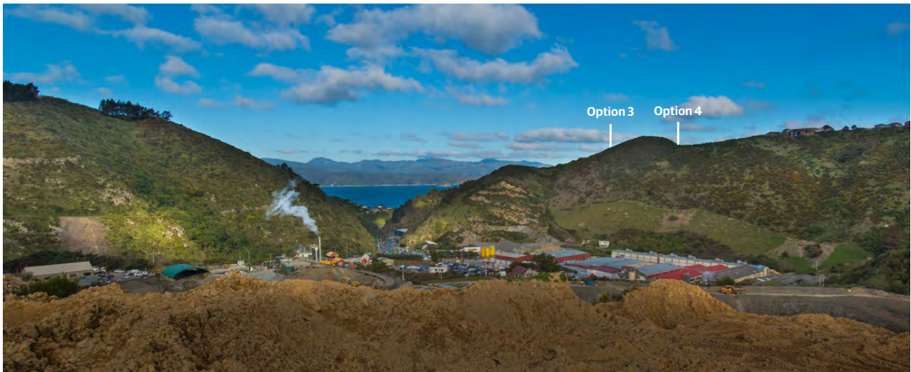
Approximate locations of the maximum extent of the quarry area cuts under options 3-4

Based on your feedback and other evidence available, we may then go through the District Plan Change process with formal submissions from stakeholders, oral hearings and a decision by an independent commissioner.