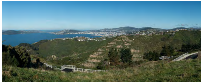
Extent of Option 3: Medium Development - Mitigated 15-20 years after quarrying

Mitigation is the process of returning the area to a natural state. This can start within the first couple of years of any expansion of the south face and starts from the top of the quarry down. The first 15 metres can be hydroseeded and can start growing quickly, depending on weather conditions. The bare quarried rocks will not be visible for more than a few years, as the process of hydroseeding is continual.