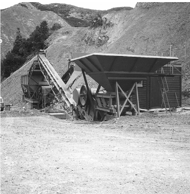
New crusher in 1967