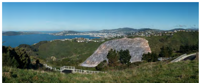
Extent of Option 4: Maximum development before mitigation