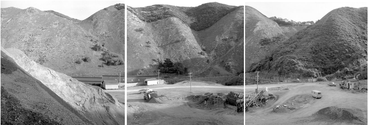
Panorama Kiwi Point Quarry 1964