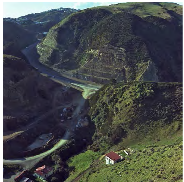
Quarry expansion in 1967