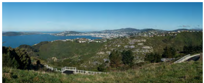
Extent of Option 4: Maximum Development mitigated 15-20 years after quarrying