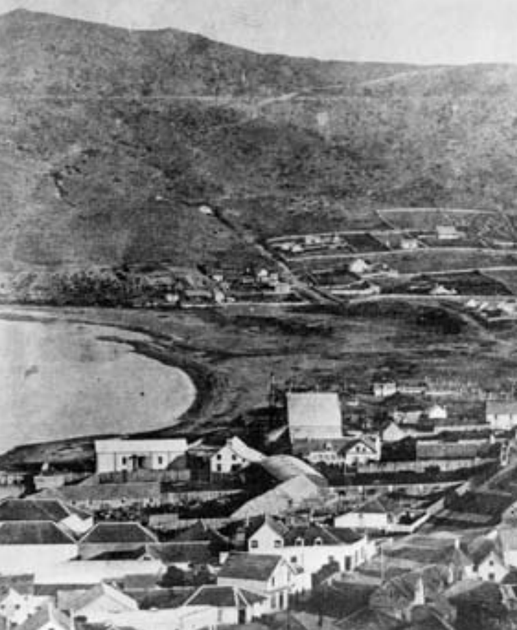
Above: An early view (1857) of Te Aro. The pa can be seen in the middle of this photograph. (ATL F1455341/2)