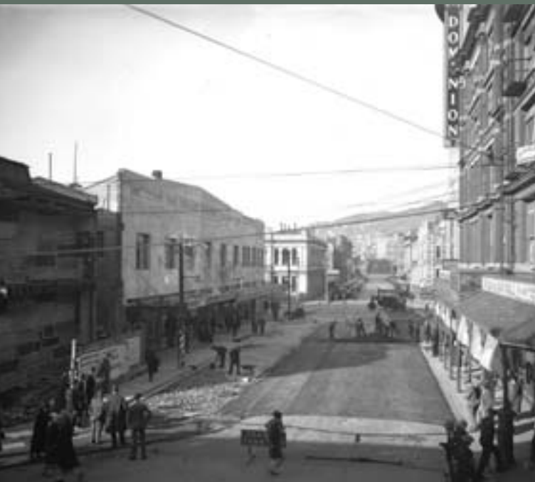
Below: Mercer Street in 1928. Mercer Buildings, on the left of the street, was a new frontage on a series of older buildings shorn of their facades to allow the road to be widened.