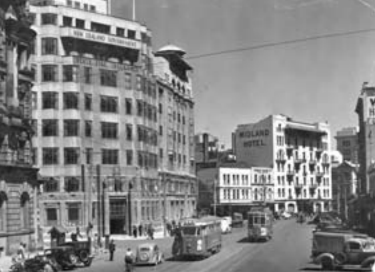
Above: State Insurance Building about 1945. Alongside it is the State Fire Insurance Building and, further down Lambton Quay, the Midland Hotel, site of Midland Park. (ATL 35201/1)

The new building made careful use of the whole Stout Street-Lambton Quay corner. It was designed by the Auckland firm of Gummer and Ford, one of the most outstanding and innovative architectural practices in New Zealand history. The use of the rhythmic, waved facade wrapped around the corner was a startling piece of design for its time and a herald of Modern architecture. The building had new features such as fast lifts, fluorescent lighting and fire protection. State Insurance was established in 1903 by the Liberal Government to provide competition for large monopolist or overseas-dominated insurance companies. The State Fire Insurance building was built on the site next door in 1919. It was demolished to make way for State Insurance's head office. State Insurance was sold to Norwich Insurance in 1990. The controversial, grille-like rooftop addition, designed by Athfield Architects, was completed in 1999, along with the sculpture in the footpath that uses the old lettering from the building.