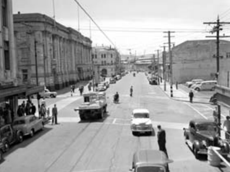
The view from lower Cuba Street, towards the harbour, in 1953. With the exception of the Town Hall, on the left, every building, and some streets, in this view have gone. (ATL 191091/2)