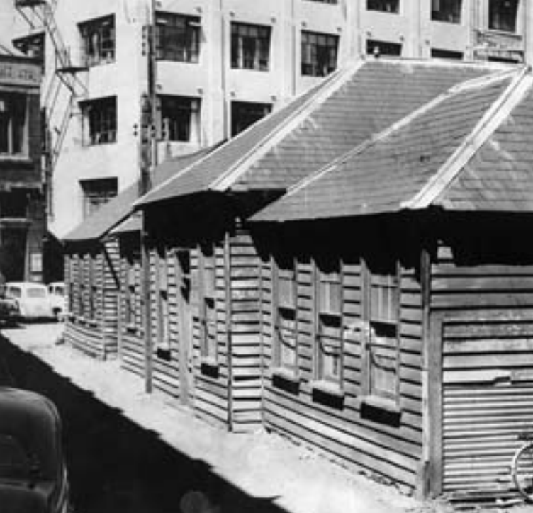
Above: Bethune and Hunter's Custom and Counting Houses in 1958, shortly before their demolition.