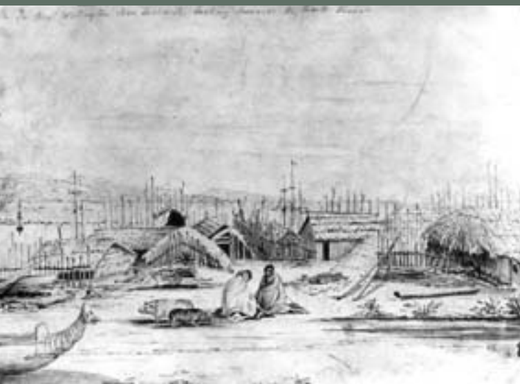
Below: A pencil drawing by John Gilfillan of Te Aro Pa in the 1840s. (ATL F1092791/2)