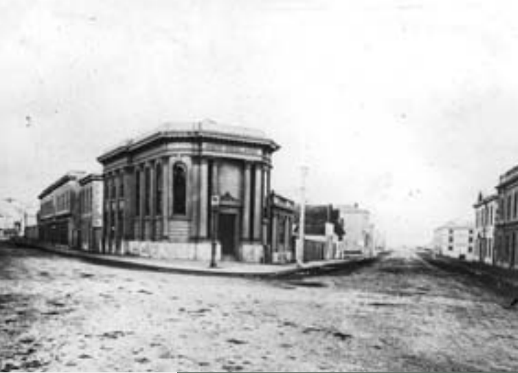
The first Bank of New Zealand building on the distinctive corner site c.1880; Lambton Quay to the left and Customhouse Quay to the right.